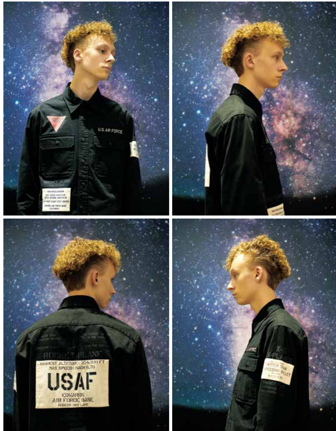
CORDURA MIX TWILL KHAKI SHIRT No.6185134 / COLOR: BLACK, KHAKI, OLIVE SIZE: M, L, XL, XXL / PRICE: ¥12,800+TAX