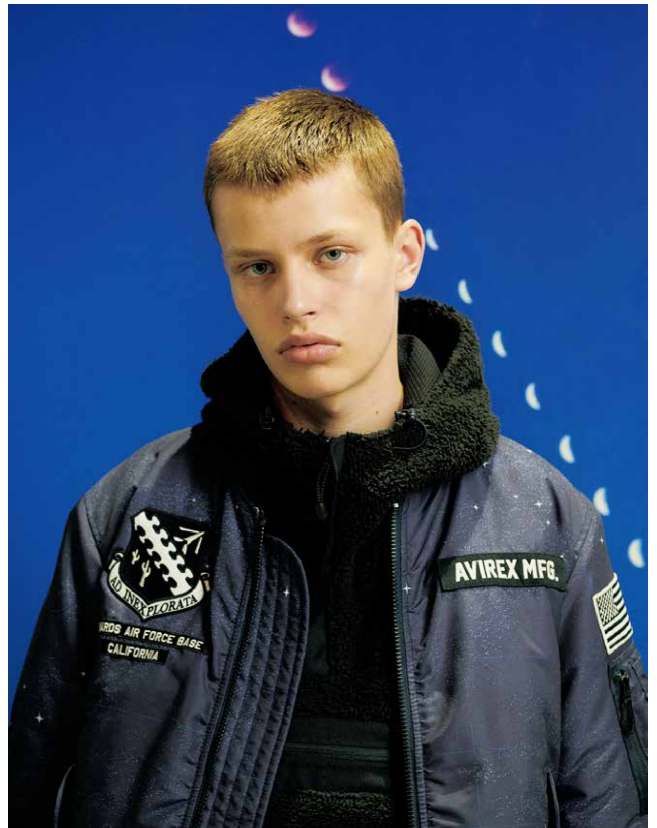
MA-1 "X-15" No.6182185 / COLOR: BLACK, L/GRAY, SAGE, CAMO SIZE: M, L, XL, XXL / PRICE: ¥26,800+TAX